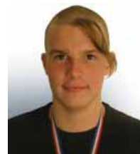
Rating: 1354 Country: Croatia