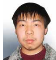
Rating: 2310 Country: China